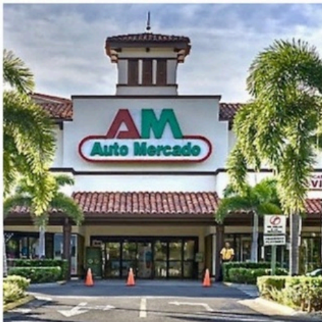
Supermarket & Retail Shops