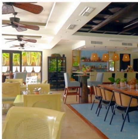
Dining room at Beach Club