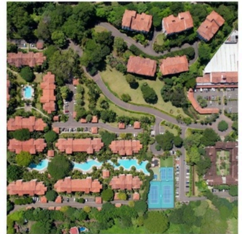
4 Pools & Sports Complex