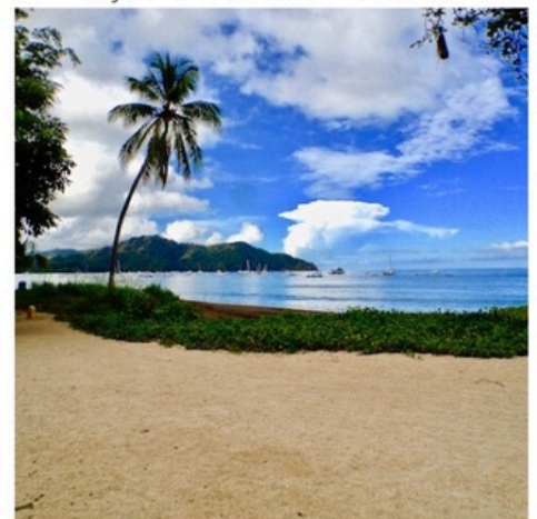
Free shuttle to Beach Club