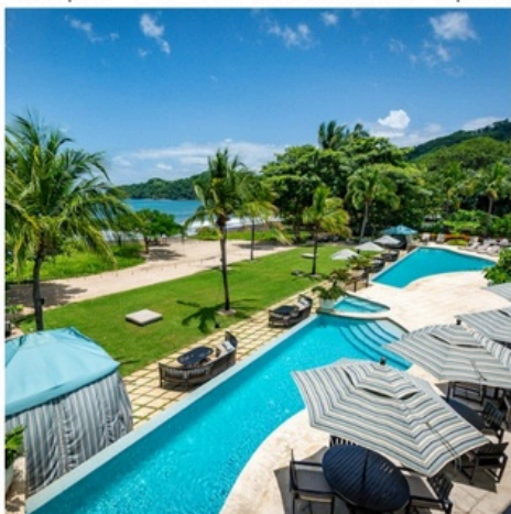
2 pools & private Cabanas