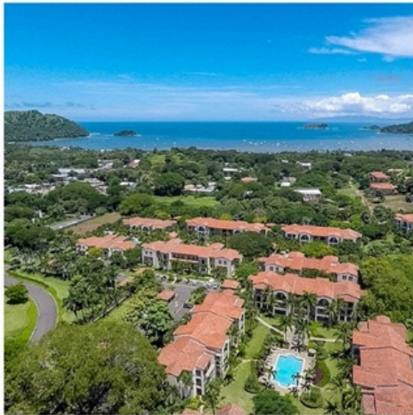
Walk to the beach!