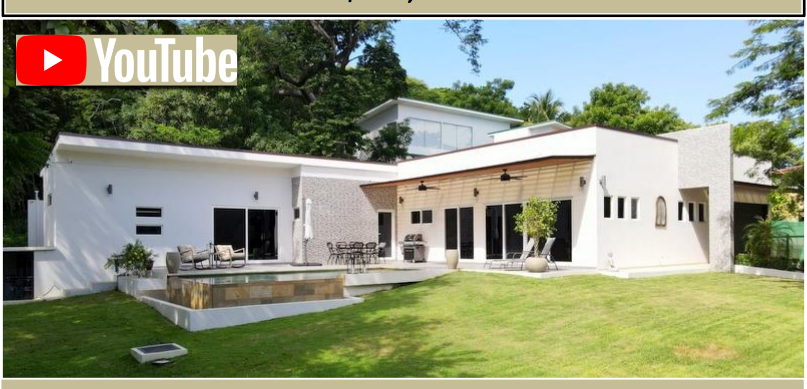
Casa Jeany -3 Bedroom-4 Bath-2615 Sq/ft-Modern Home-Isabella-Playas del Coco-$729,000

3 Bedroom-4 Bath-2615 sq/ft-Modern Home-Isabella-Playas del Coco $729,000