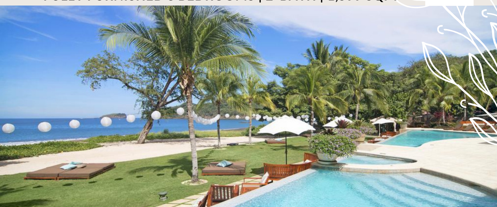
Playas del Coco