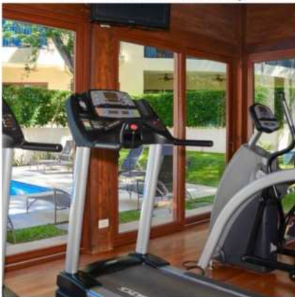
Fully equipped Fitness Center