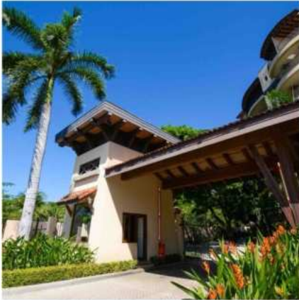
24/7 Gated Security