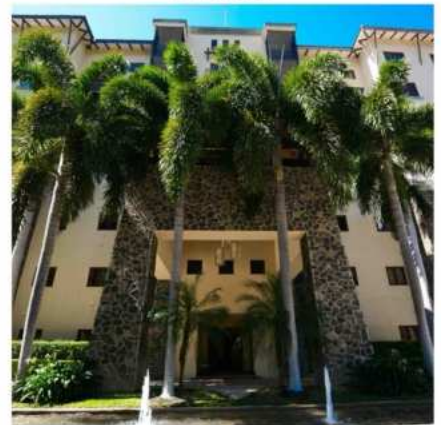
Less than 25 min. from Airport