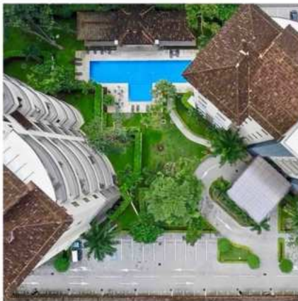
Covered assigned Parking