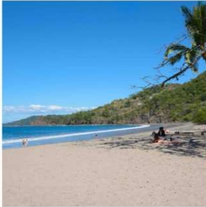
2 min. walk to beach